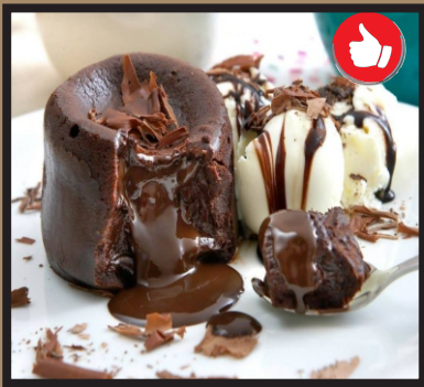
Molten Lava cake