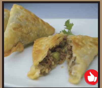
Homemade Greek samosa