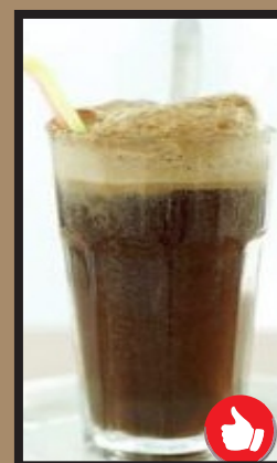
Root Beer Float