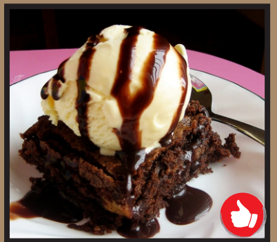
Chocolate Fudge Brownies