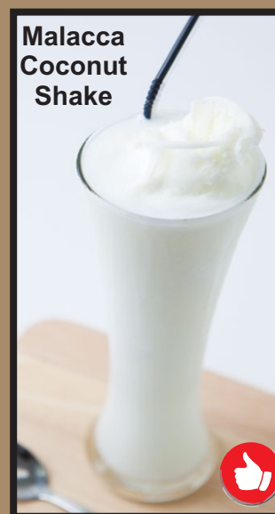
Malacca Coconut Shake