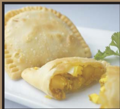
Homemade curry puff