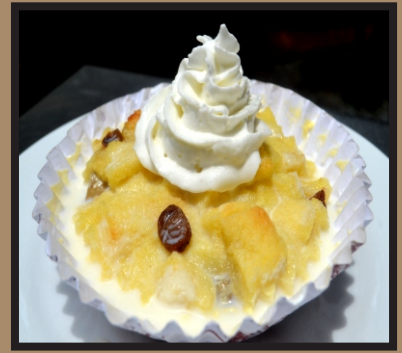
Bread butter pudding

Bread & Butter Pudding RM 8 served with whipping cream